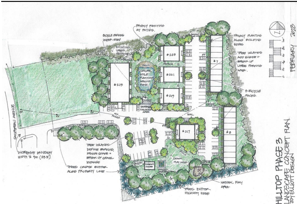
Image 3. Updated landscape plan.