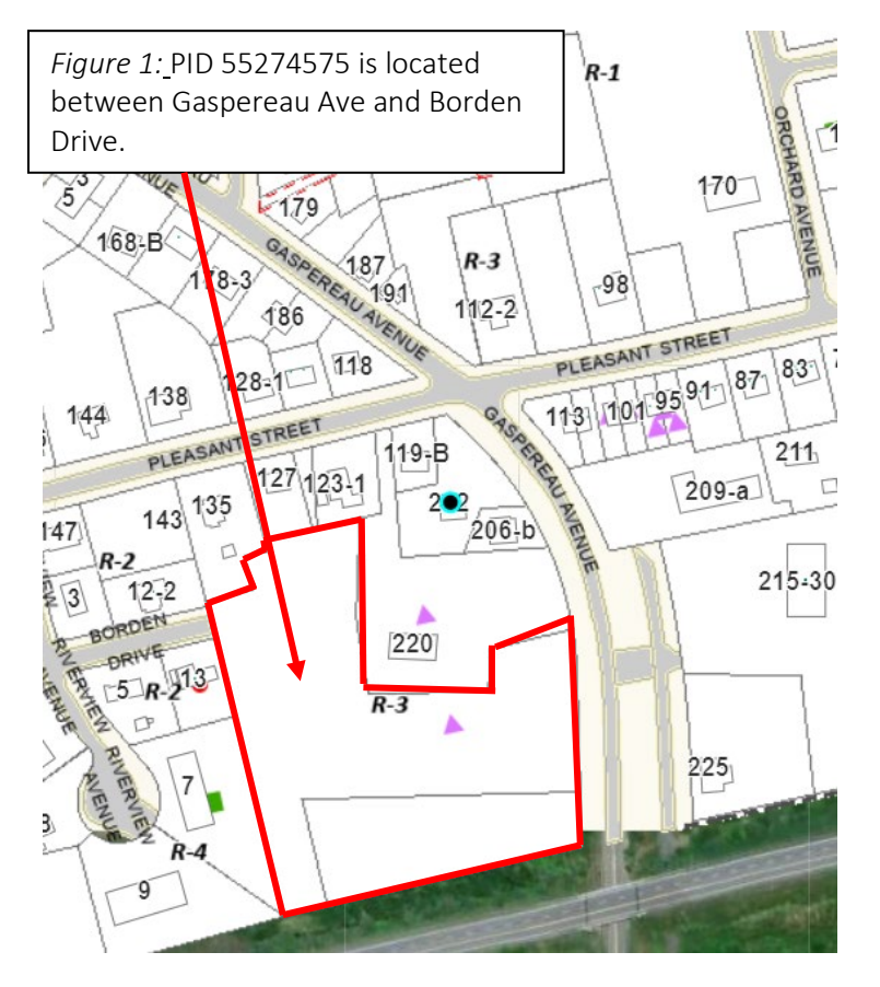
Figure 1. Context Map.

Peter Polley on behalf of Polycorp, is seeking to rezone a property on Gaspereau Avenue (PID 55274575) as shown in figure 1 below from the Medium Density Residential (R-3) zone to the High Density Residential - Multi Dwelling Unit (R-MDU) Zone.