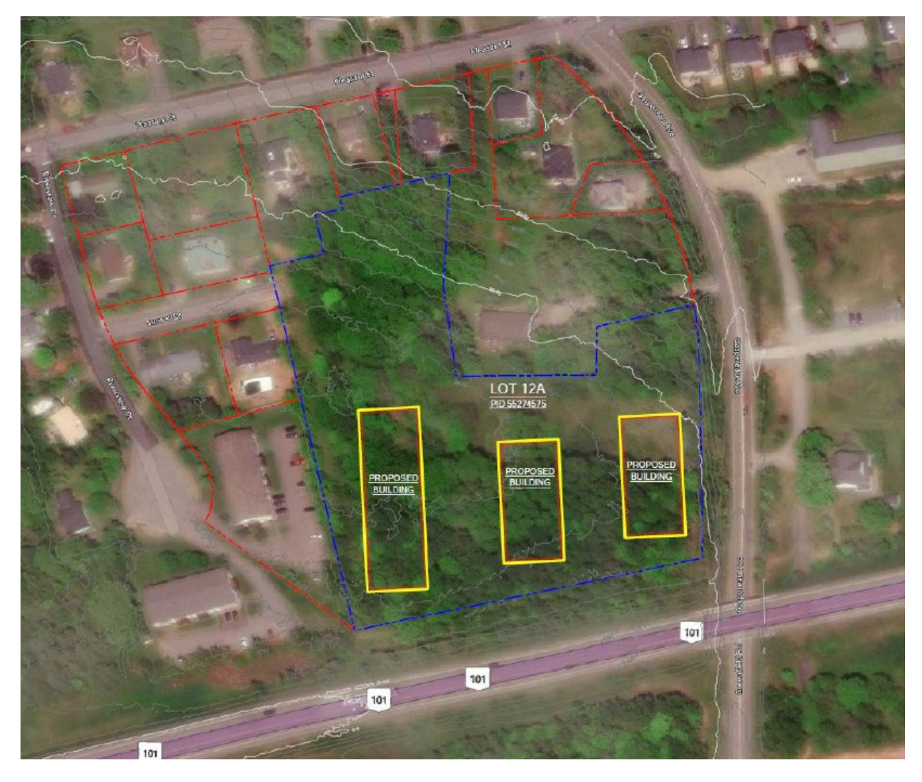
Figure 2 below shows a preliminary site plan with three multi-unit residential buildings.