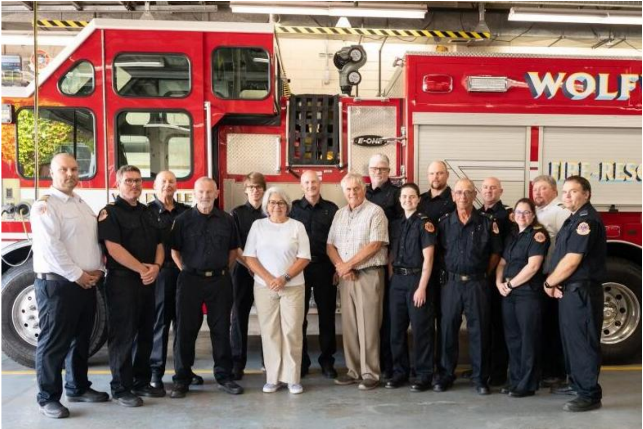
(Members of the Wolfville Fire Department with Her Excellency Mary Simon, Governor General of Canada)

The Wolfville Fire Department (WFD) was established in 1890 and continues to service our community with pride and dedication. While in many communities the Fire Department is established as a separate non-profit society, the WFD is a department of the Town, which owns all the major assets. The Town also employs an Operator / Mechanic, while the firefighters are volunteers.