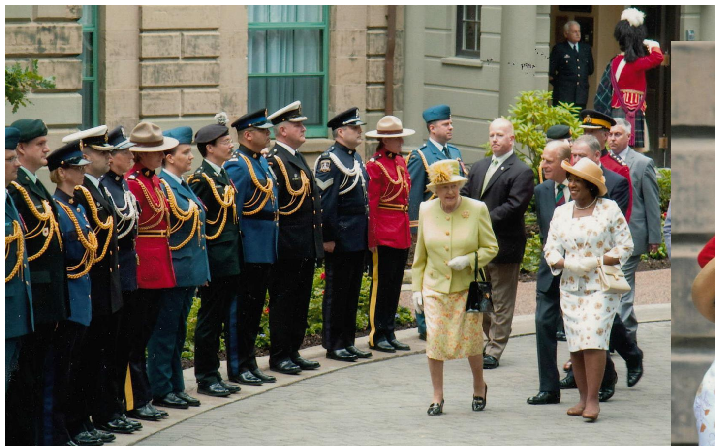
The Queen's visit to Government House, Halifax Nova Scotia 2010