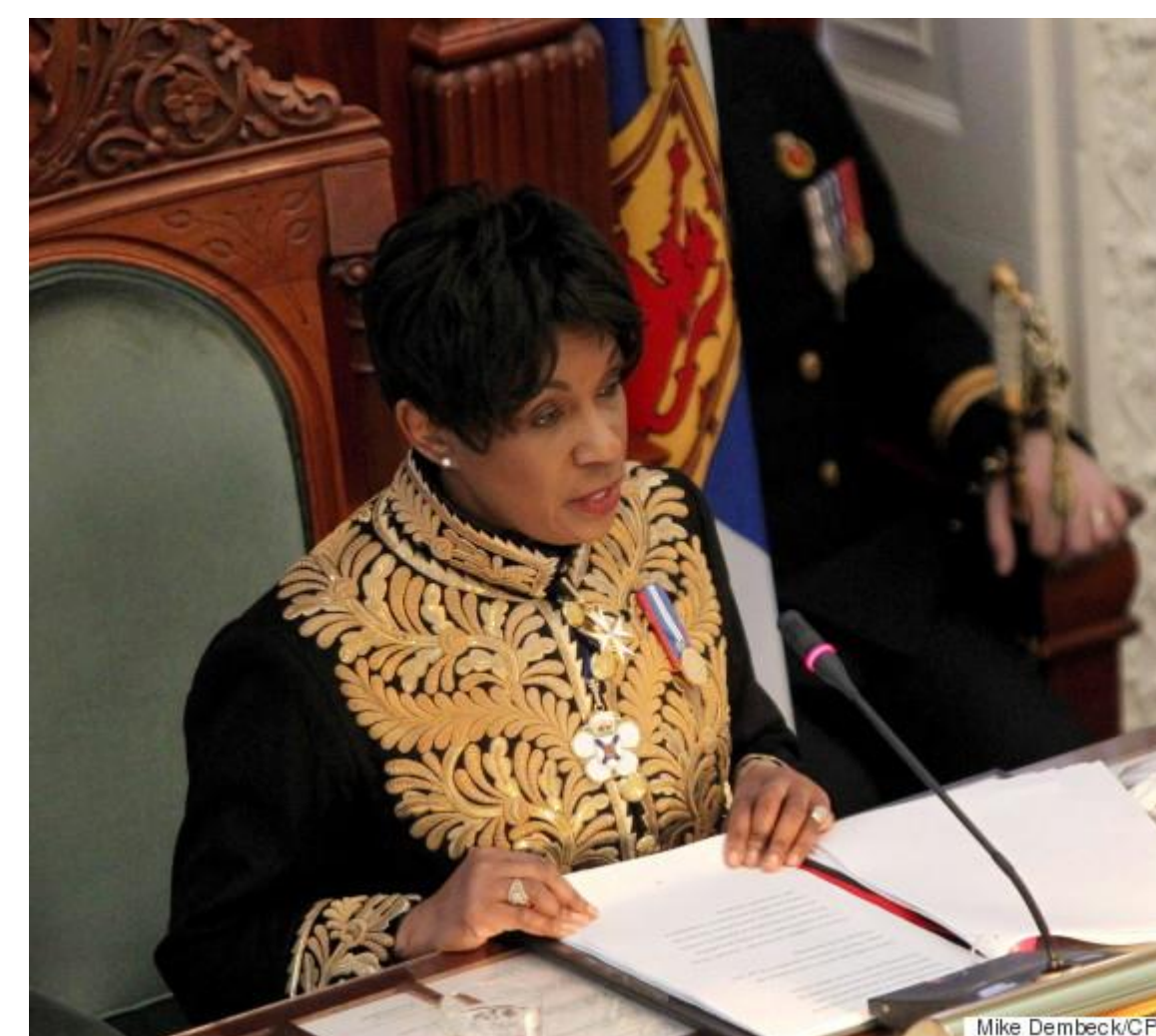
Lieutenant Governor Mayann Francis reads the Speech from the Throne, third session of the 61st General Assembly of the Nova Scotia legislature