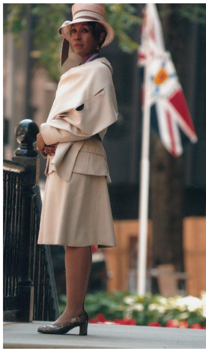
Royal Salute, September 2006