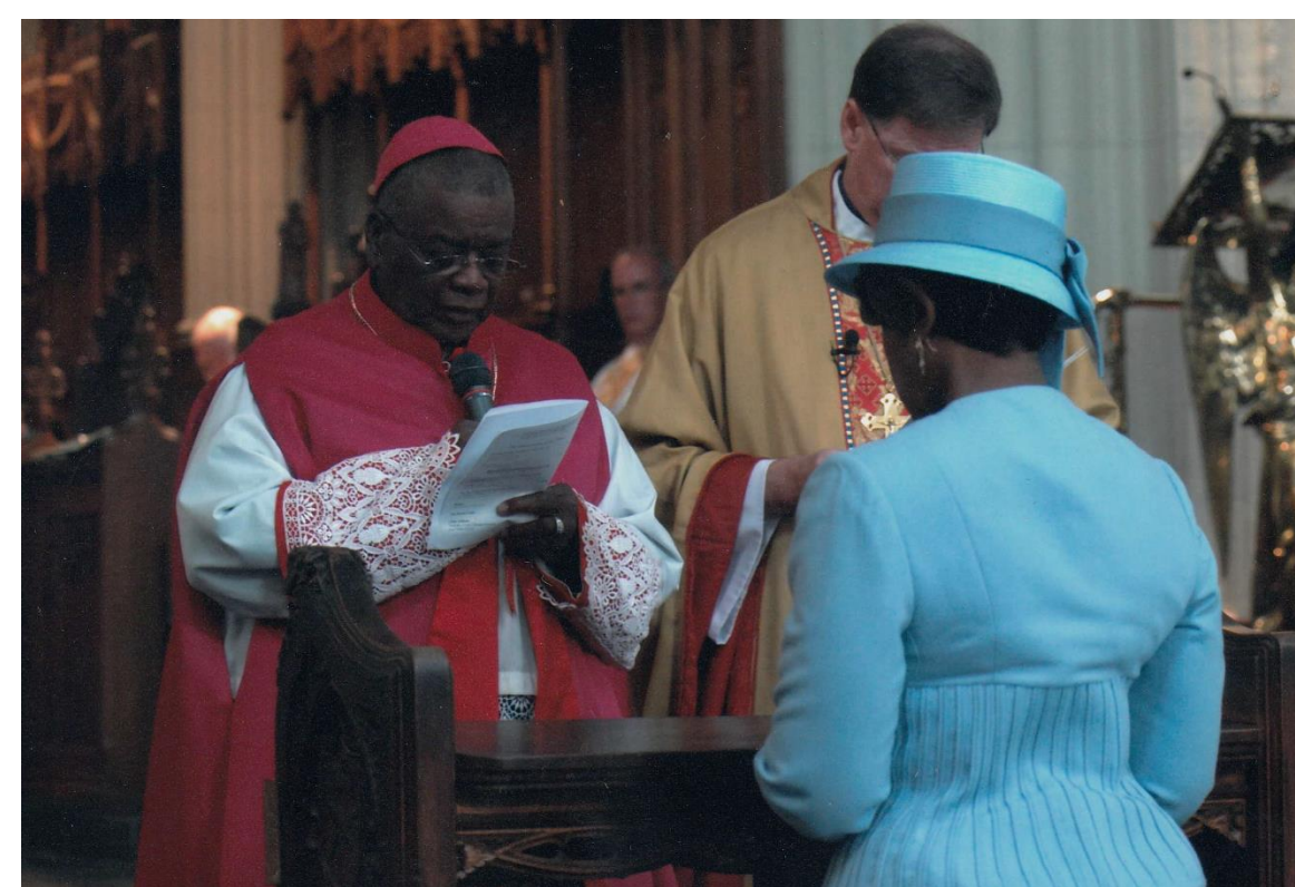
Receiving a blessing, All Saints Catholic Church Halifax 2006

As Lieutenant Governor she supported the arts, celebrated young people, opened Government House for guest lectures and conferred a posthumous free pardon on Nova Scotia civil rights pioneer and entrepreneur, Viola Desmond. She was the first vice-regal representative in Canada to grant a free pardon. In 2015 The Honourable Doctor Mayann Francis was appointed to the Faculty of Management, School of Public Administration, Dalhousie University, as the first Distinguished Public Service Fellow.